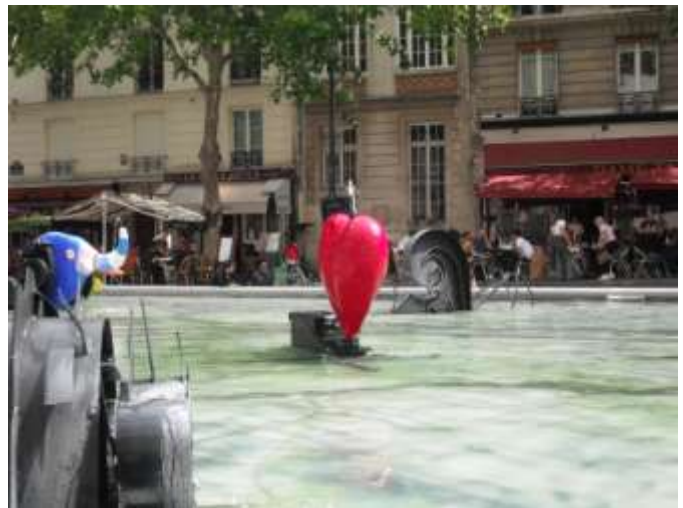
Outside the Pompidou Center— a turning heart