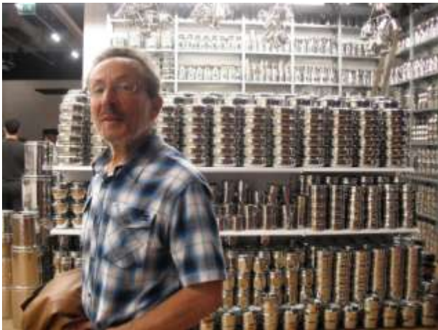
Is this art? (part of exhibition on India) It's on the ceiling too!