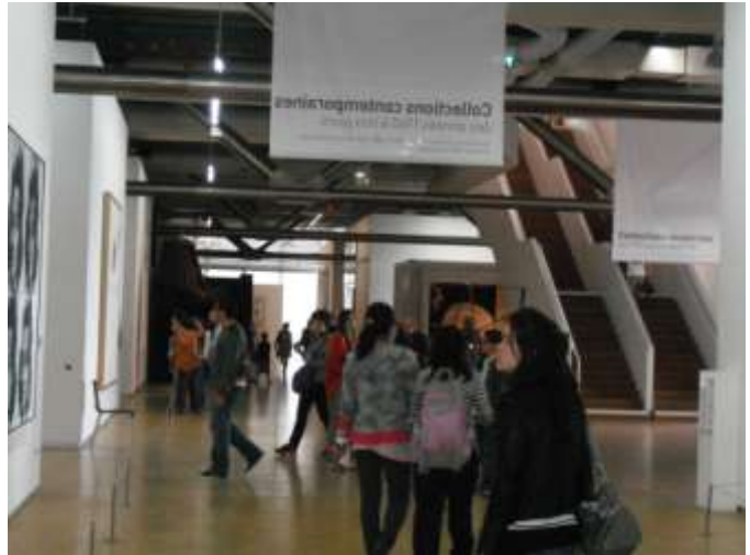
On the contemporary art floor