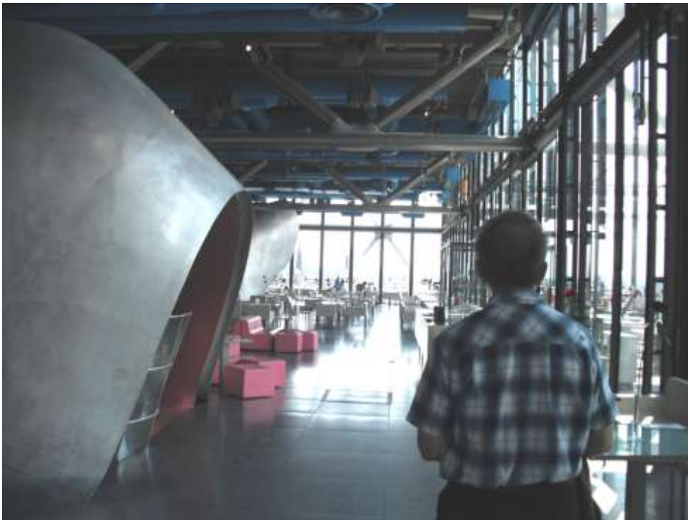
Entrance and view of the restaurant (6 ème )