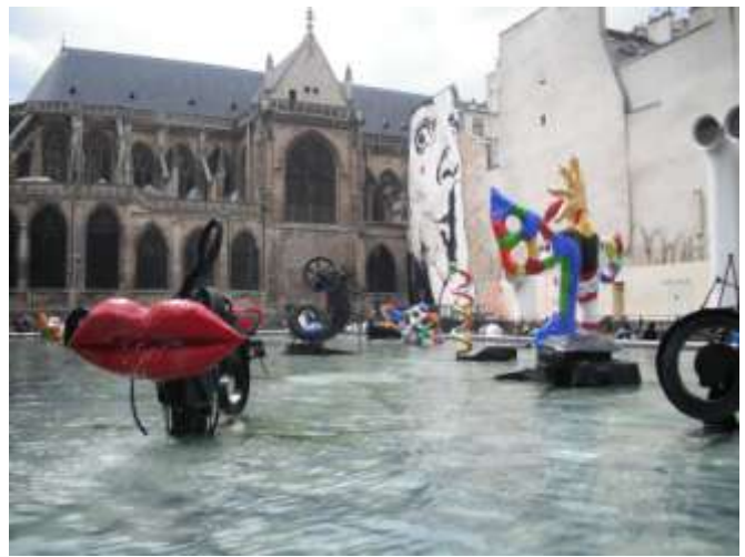
Outside the Pompidou Center— a turning hat and a fountain